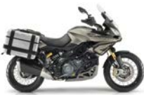
CAPONORD 1200 RALLY SAFARI GREY