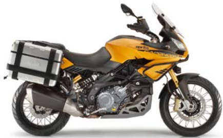
CAPONORD 1200 RALLY

Caponord 1200 has a manually adjustable shock absorber in terms of spring preload and extension hydraulics and a USD fork, fully adjustable in extension, compression and spring preload with 43 mm stems, with aluminium die-cast feet.