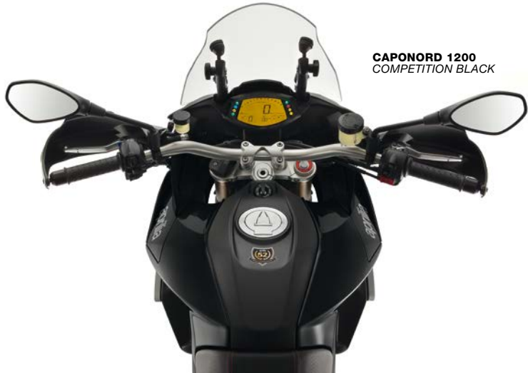
CAPONORD 1200 COMPETITION BLACK

Calibrated, with power cut to size at 100 hp for you to enjoy yourself even in non-optimal grip conditions or on wet asphalt.