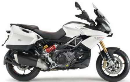
CAPONORD 1200 TRAVEL PACK