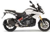
CAPONORD 1200 GLAM WHITE