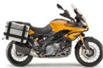
CAPONORD 1200 RALLY DUNE YELLOW