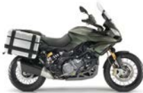
CAPONORD 1200 RALLY ARMY GREEN