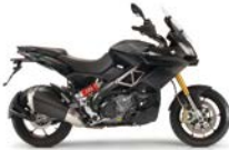
CAPONORD 1200 COMPETITION BLACK