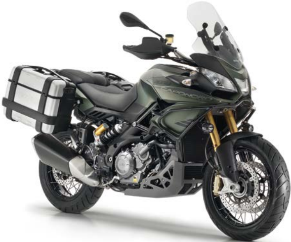
CAPONORD 1200 RALLY ARMY GREEN