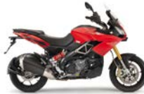
CAPONORD 1200 FORMULA RED