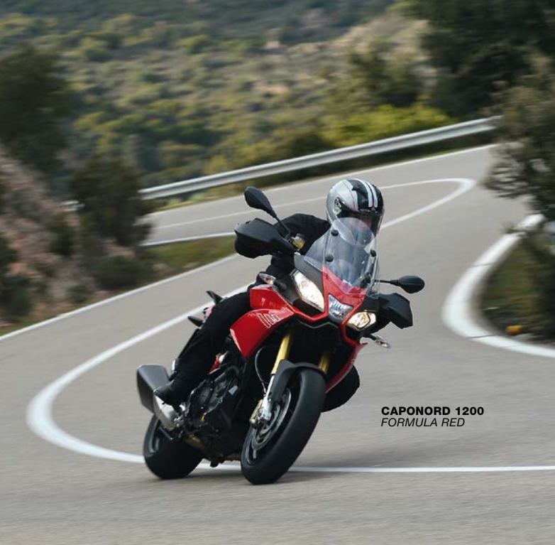
CAPONORD 1200 FORMULA RED

Fully digital, the Caponord 1200 dashboard allows you to keep everything under control: selected engine map, electrical adjustment of the spring preload, gear position, level of adjustment of the ATC system and functioning of the optional heated grips.